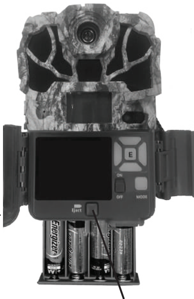
Battery Eject Button

Slide the battery tray into the closed position.